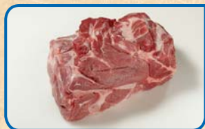
Shoulder Roast; bone-in