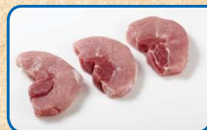
Sirloin Chop; boneless