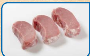
New York Chop