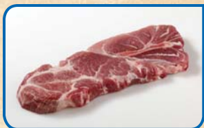
Shoulder Steak; bone-in