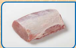
New York Roast