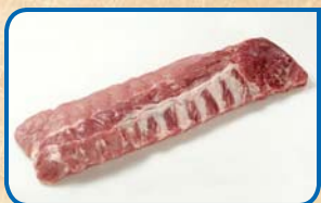
Loin Back Ribs