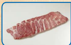
St. Louis-Style Ribs

For recipe ideas visit: www.PorkBeInspired.com