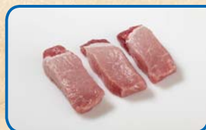
Loin Country Style Ribs; boneless