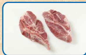
Shoulder Country-Style Ribs; bone-in