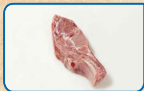
Loin Country-Style Ribs; bone-in